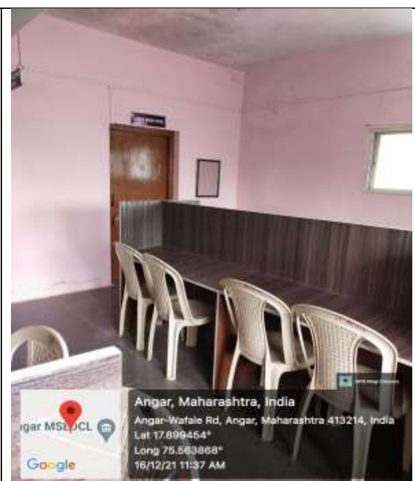
Girls Computer room facilities