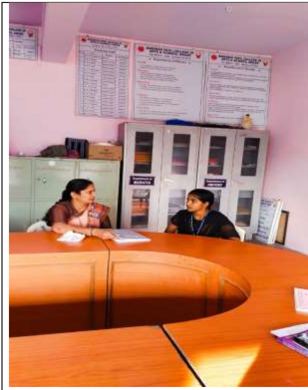
Girls Councelling facilities