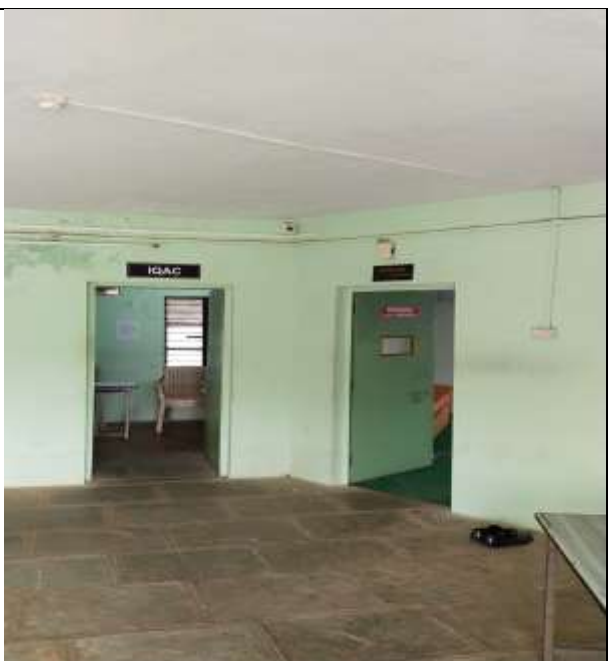
CCTV Surveillance in Principal Cabin