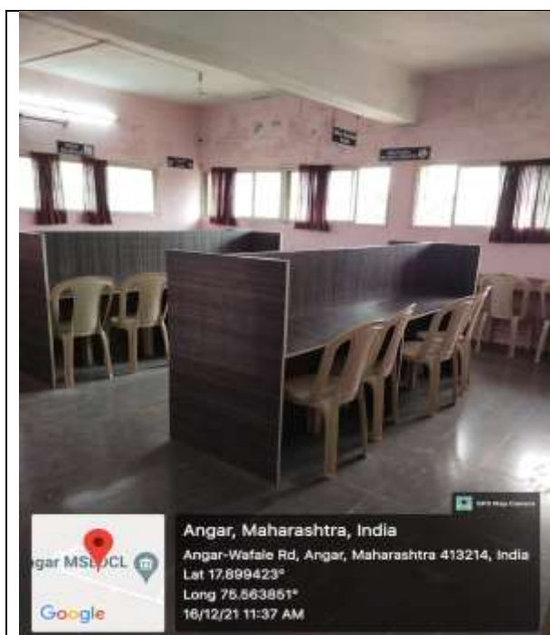
Girls Reading Room facilities