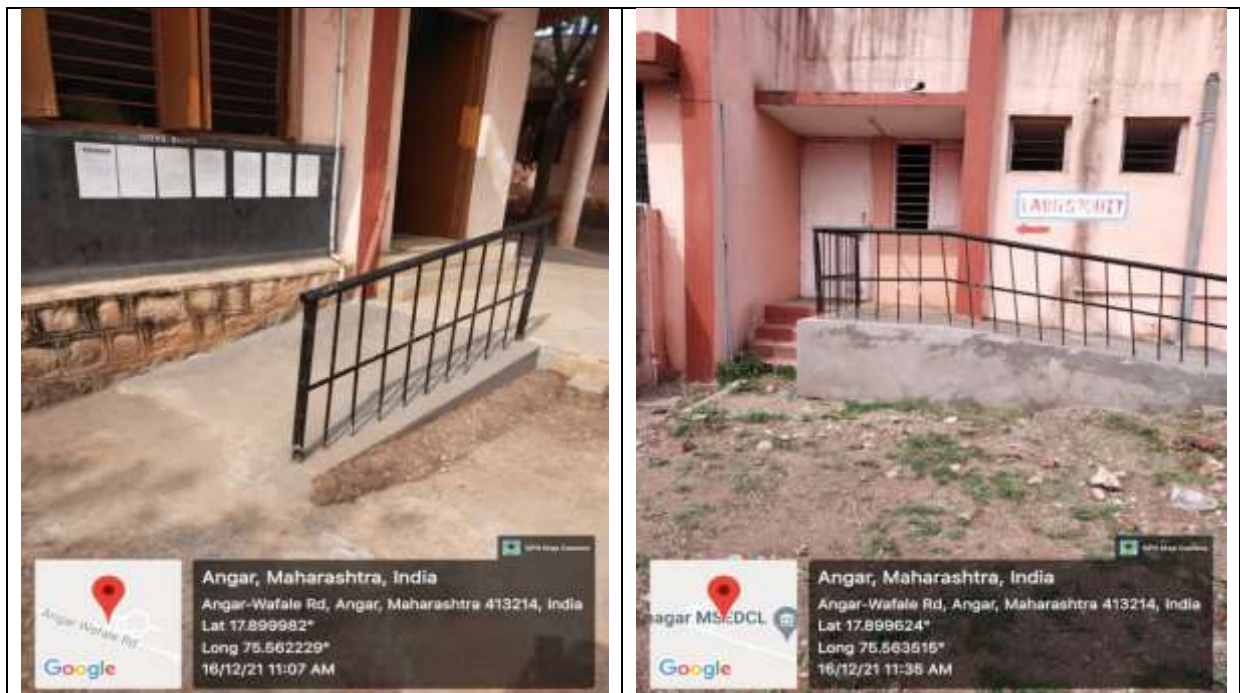
Ramp Facilities Ramp & Departmental Ladies Toilet facilities