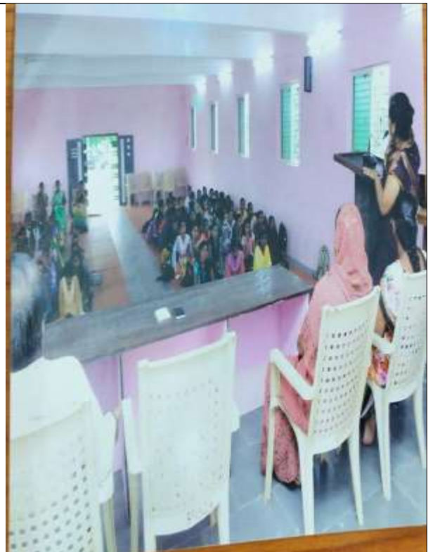
Guest Lecture On Women