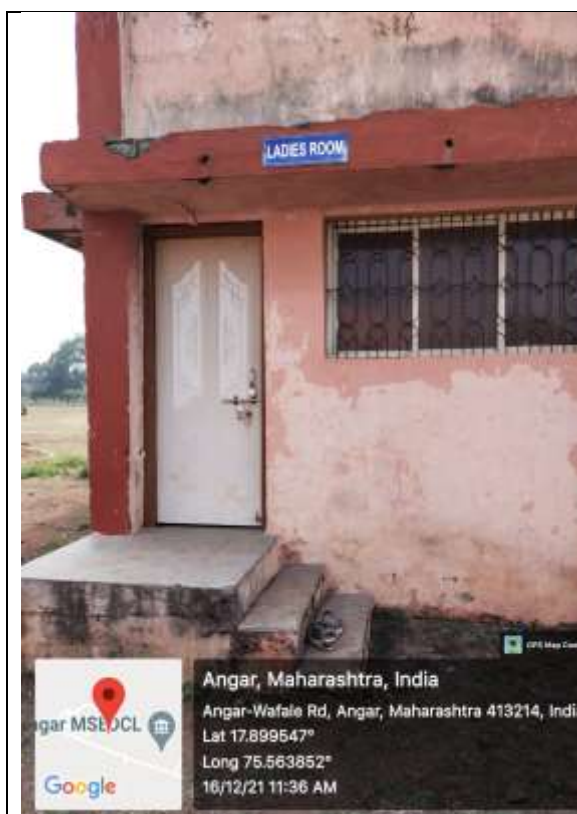
Separate Waiting Cum Recreation Room