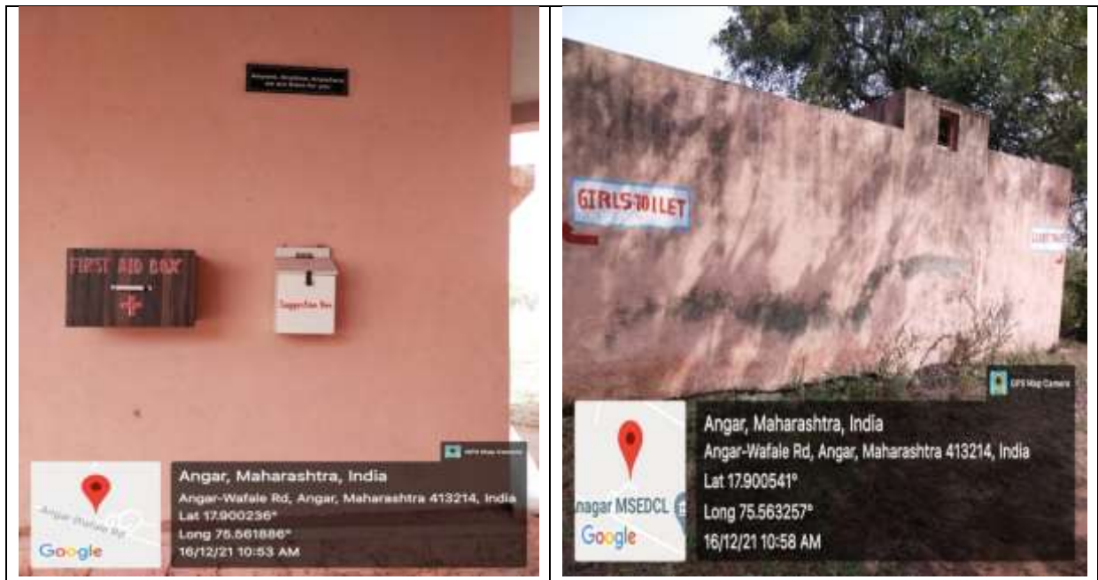
Suggestion Box and First Aid Box facilities Ladies Staff & Girls Toilet facilities