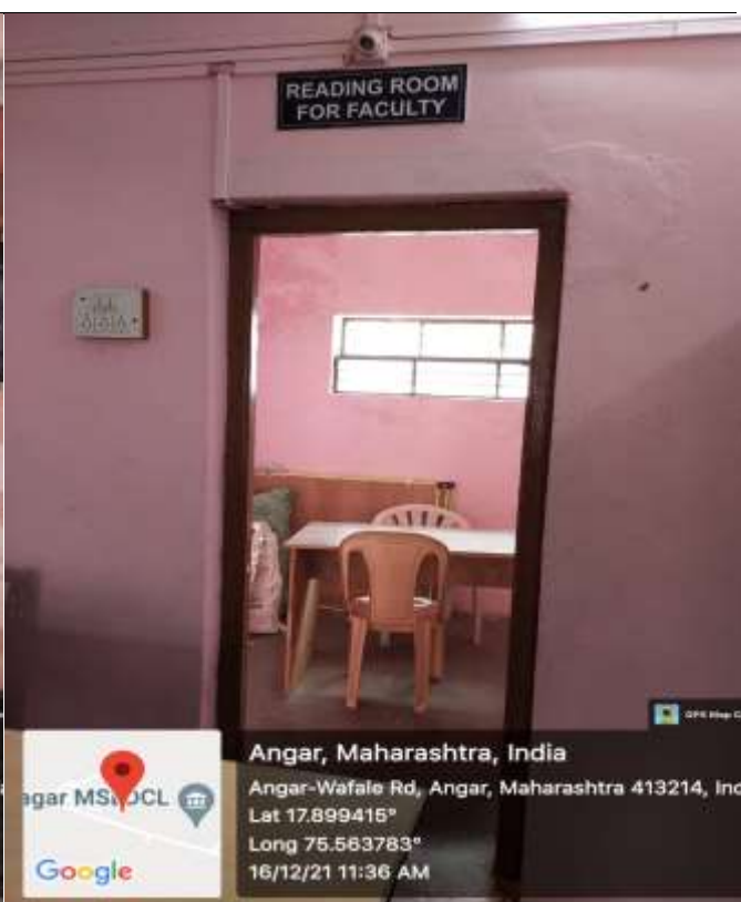
Ladies Faculty Study Room facilities