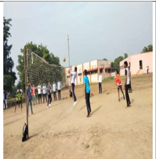
Gender equity in sports activities